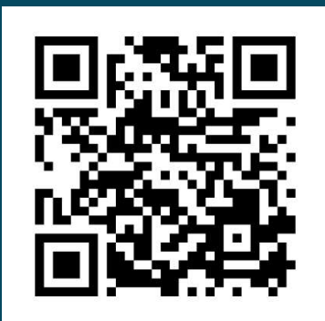
Main HED Webpage