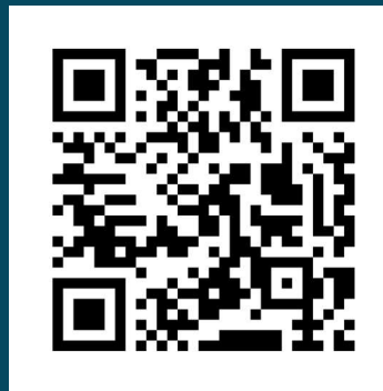
Reach Higher New Mexico Webpage