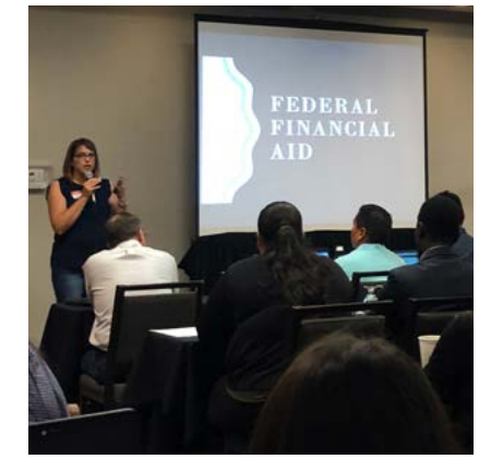
College Connect NM -Community Outreach

90+ Employees with an Average Tenure of 13+ Years