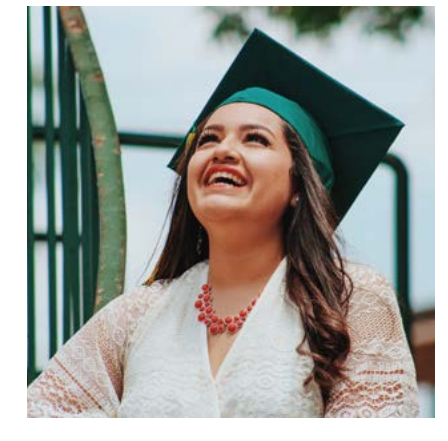
New Mexico Student Loans

This is a partnership with New Mexico's public colleges and universities and produces events promoting higher education at New Mexico high schools and provides scholarships to seniors attending a college in NM.